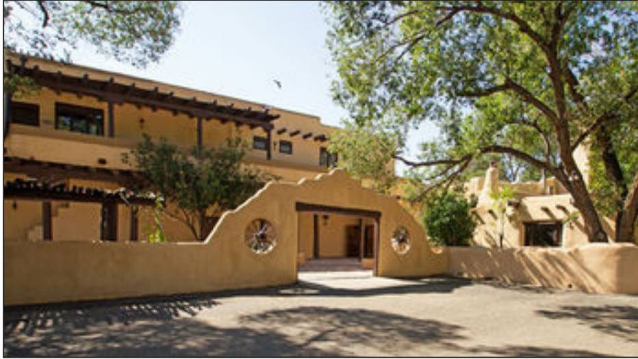
Experience the flavor of the Southwest at the Sagebrush Inn!

This hotel provides many amenities including a free breakfast. Visit their website .www.sagebrushinn.com for more information. Call 1-800-428-3626 for reservations.